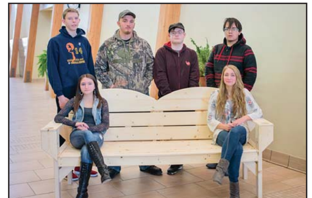
Bench built by high school Woodworking students

High School Vocational Classes are held during the regular school day and count toward high school credit. Additionally, college (concurrent) credit is available for many CCHEC vocational classes for students ages 16 and over. Talk to your teacher or high school counselor about how to obtain free college credit!