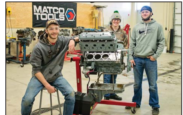
High School Automotive students rebuilt the above engine in class.